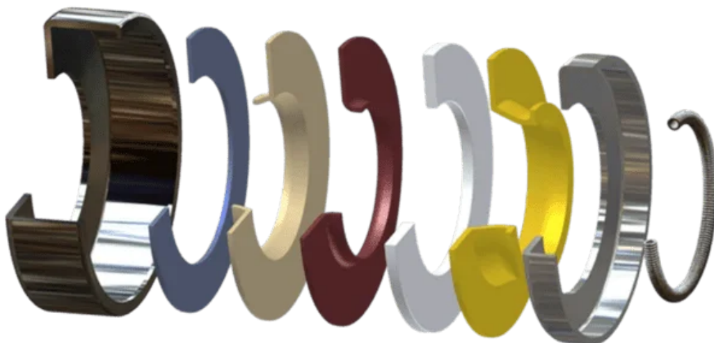
Exploded 3D view of an Omniseal ® Rotary Lip Seal, highlighting its key components and structure.

For a more detailed explanation of the design and function of Omniseal ® Rotary Lip Seals, you can refer to our blog post, "What is a Rotary Lip Seal?"