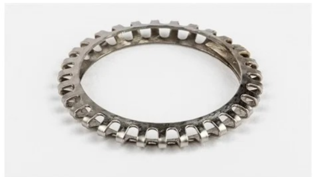
Omniseal ® RACO ® Spring-Energized Seals.