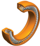
Omniseal® Spring-Energized Seals