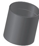
Meldin® Bearings Surgical tools Endodontics (obtrusion)