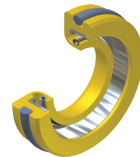
DynaLip® Lip Seals

Pharmaceutical Mixer Home Medical Equipment – Respiratory Surgical Tools